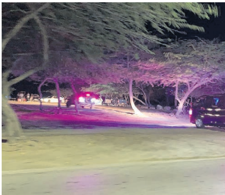
BUSHIRI - Diadomingo marduga mobile eenheid riba caya completo poniendo ordo y trankilidad a pasa tambe e tereno di ex Bushiri hotel.

Aki ta unda cu e oficialnan a topa cu un grupo di auto di hende cu musica halto y bebemento a atende cu nan tur pa bandona e sitio. Asina e grupo a plama y e area a keda limpi limpi.